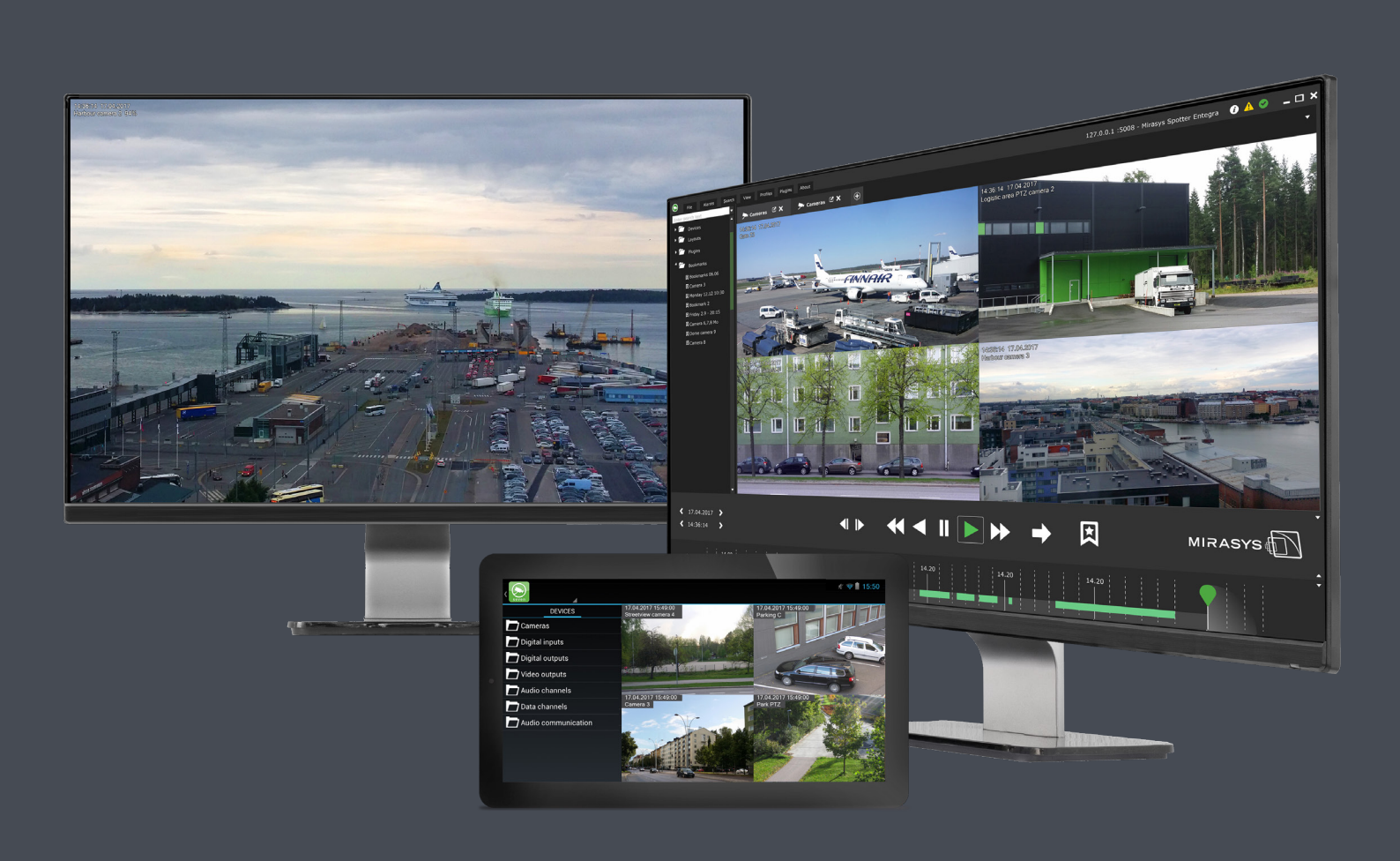
Mirasys Video Management System - illustrative image

Via integration options on all architecture levels, the VMS supports process optimisation, security, business data analyses with AI tools and seamless connection to other operation relevant sensors and systems. As result, all collected data can be efficiently utilised to make better decisions and reduce cost.